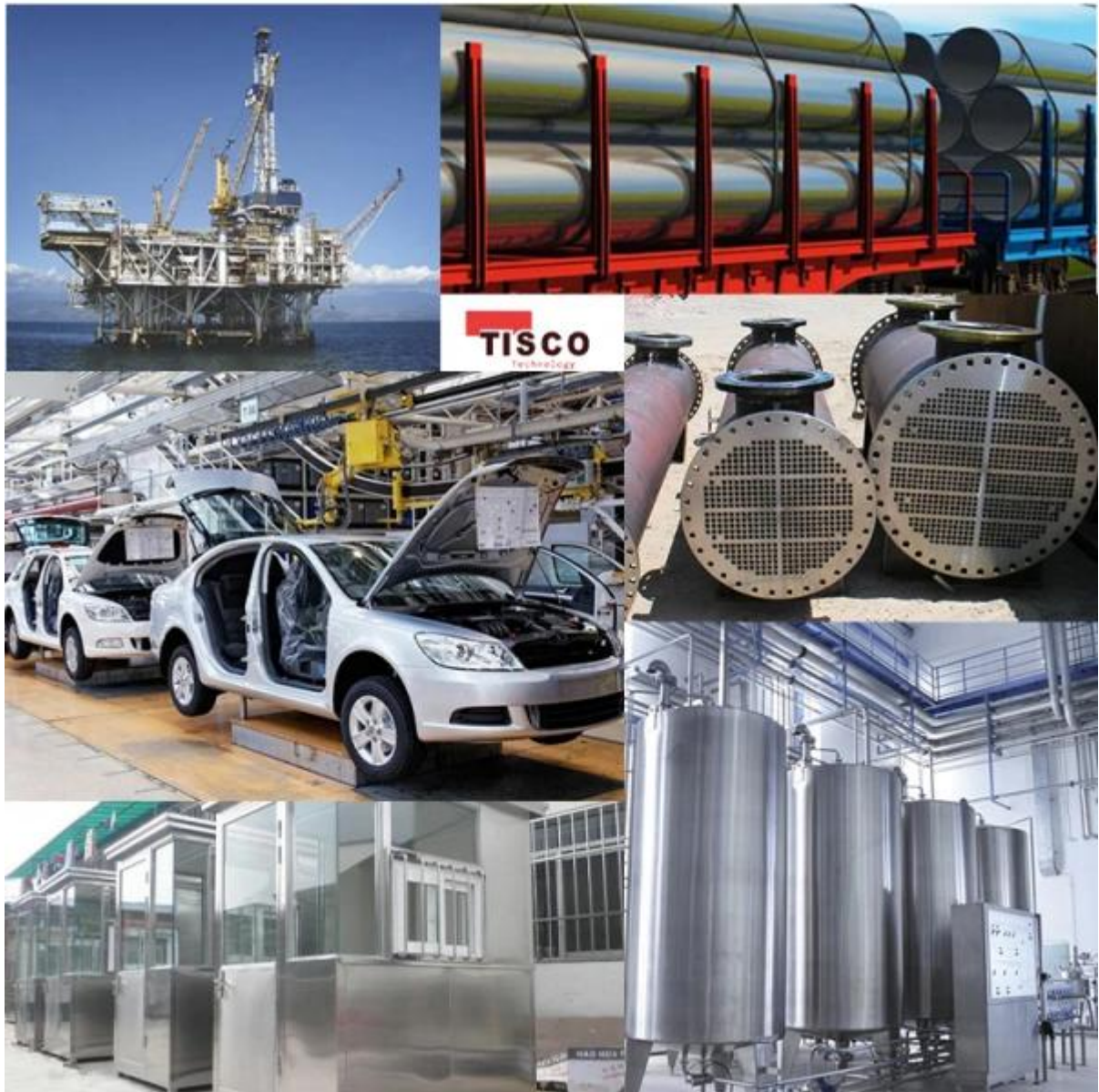
Details of the Bewell® 304L Seamless Sanitary Grade Pipe